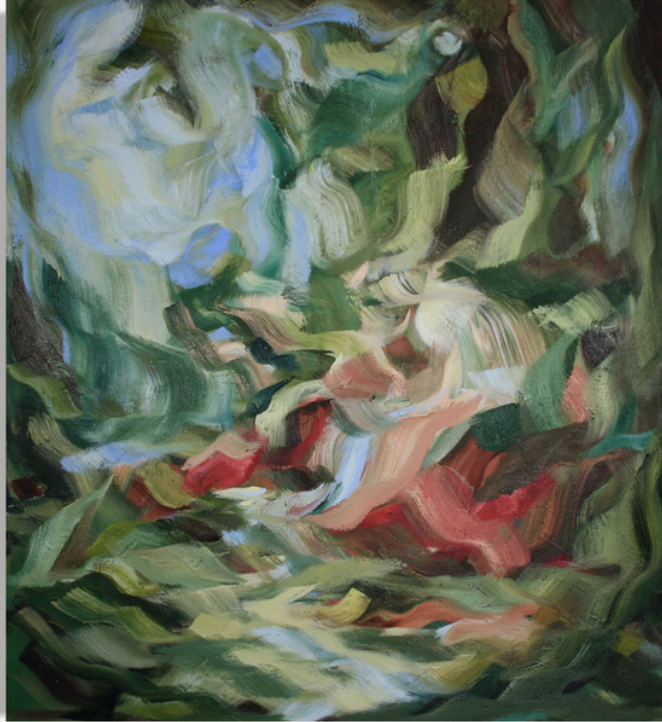
Romance With a Fantasy (3), 2022