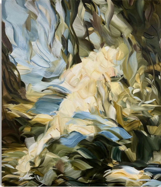
In the Swell of Spring II, 2024 oil on canvas 110 x 90 cm