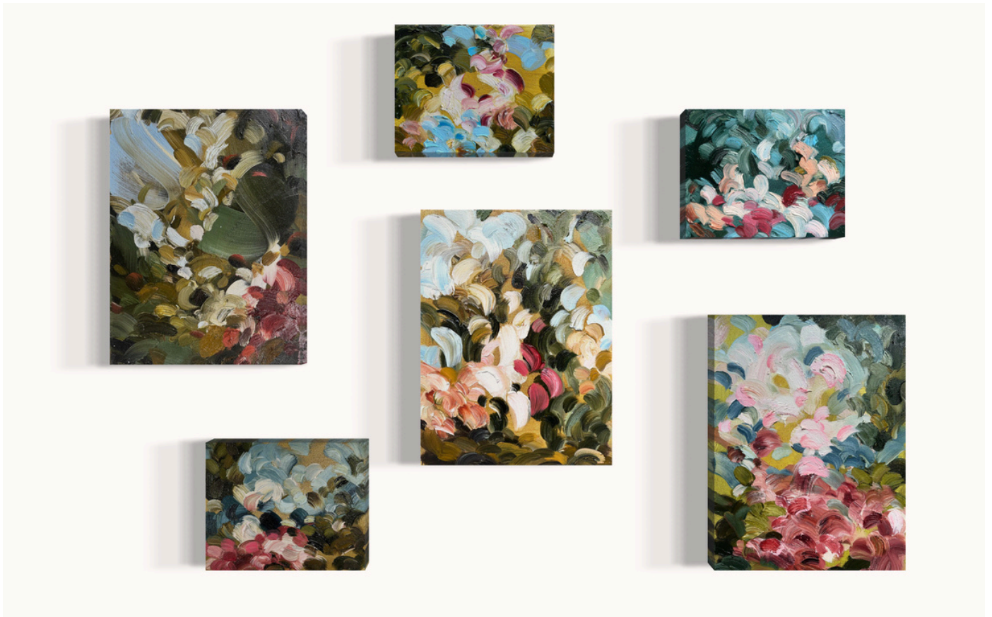
Selection of Colour Studies, 2024 oil on canvas