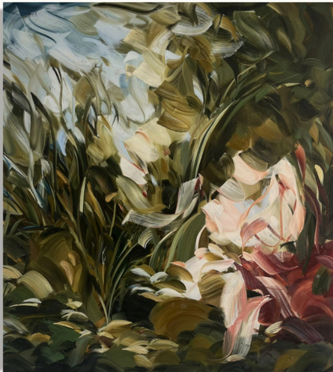
Fled Across the Wilds, 2024 Oil on Canvas 145 x 130 cm