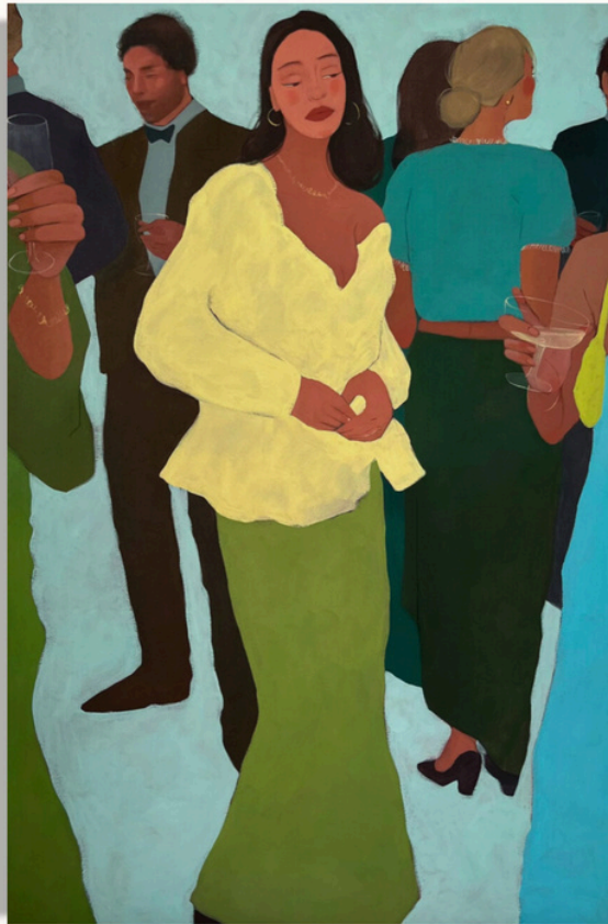
Two Minutes to Midnight, 2023 acrylic on canvas 200 x 130 cm