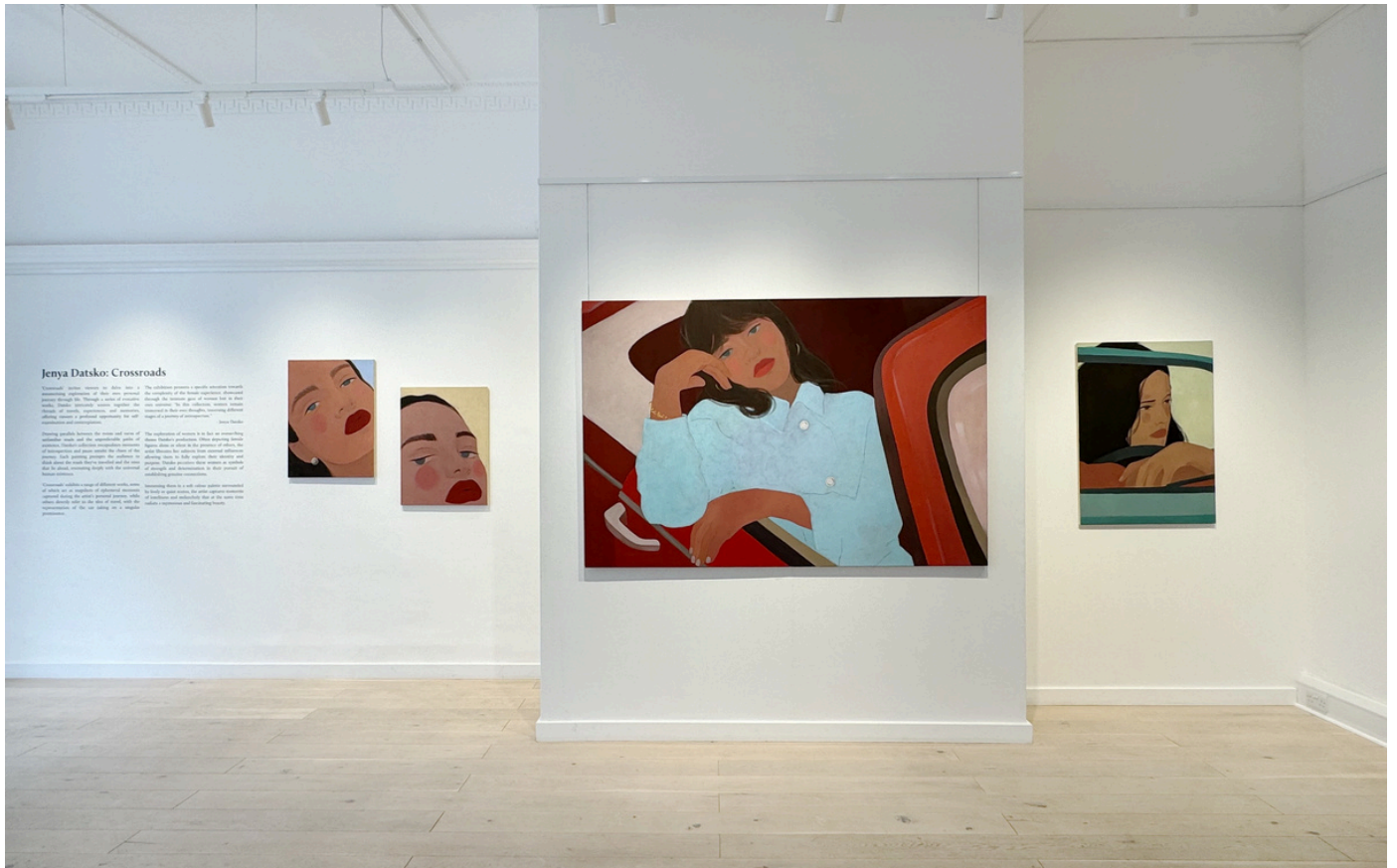
Installation View 'Crossroads' Gillian Jason Gallery, London, UK