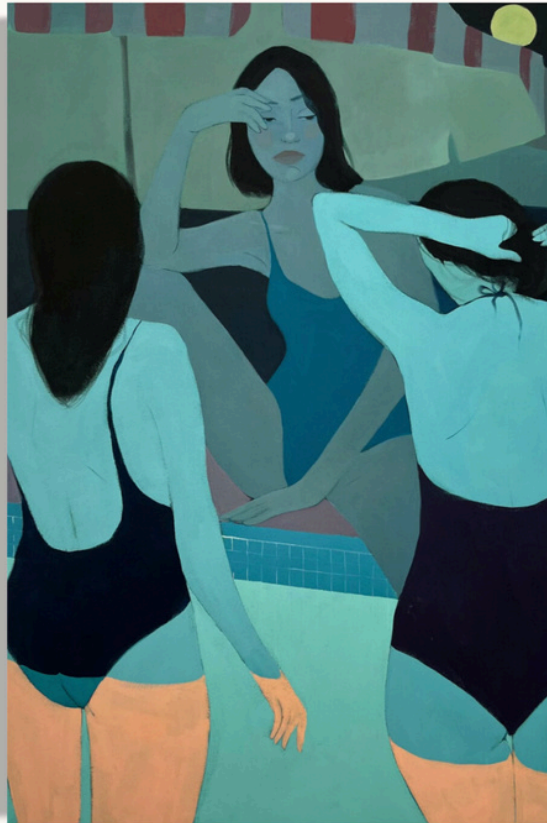
Late Night in Mallorca, 2023 acrylic on canvas 150 x 100 cm