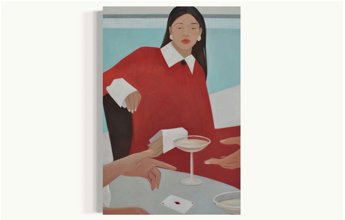
A Winner, 2025 oil on canvas 150 x 100 cm