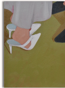
The Distance I, II, 2025 oil on canvas 33 x 24 cm