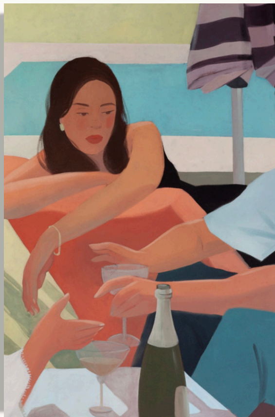
Poolside Conversation, 2024 acrylic on canvas 150 x 100 cm