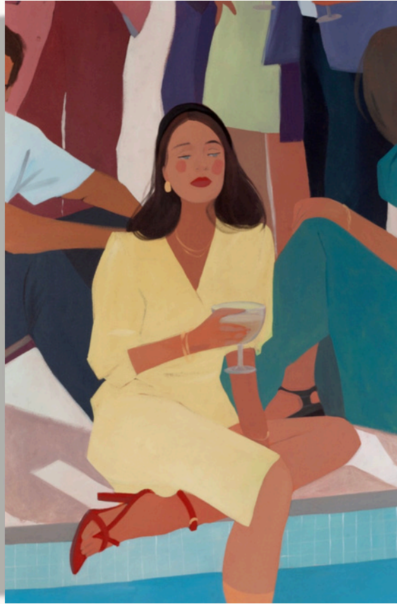
La Casa Con Piscina, 2024 acrylic on canvas 150 x 100 cm