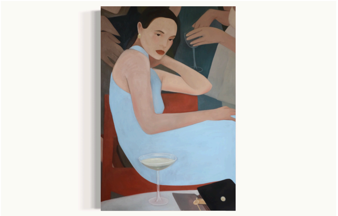
Just Half an Hour, 2025 oil on canvas 150 x 100 cm