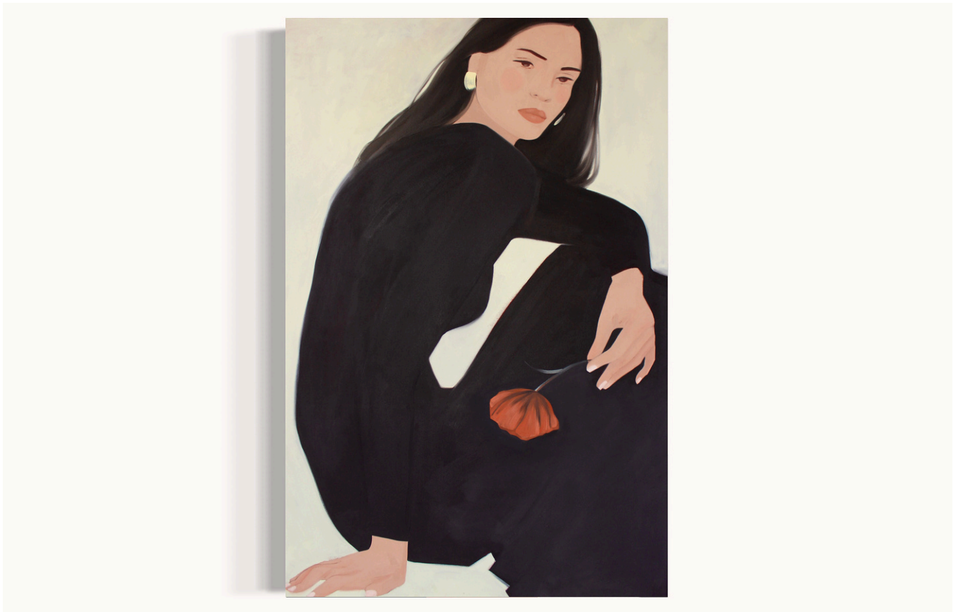
Umrba , 2024 oil on canvas 150 x 100 cm